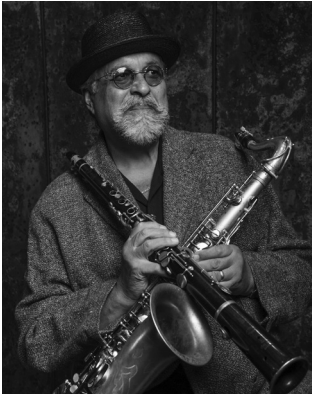
JOE LOVANO , saxophone

Reeves' most recent release, Beautiful Life , features Gregory Porter, Robert Glasper, Lalah Hathaway, and Esperanza Spalding. Produced by Terri Lyne Carrington, Beautiful Life won the 2015 Grammy for Best Jazz Vocal Performance. Reeves is the recipient of honorary doctorates from the Berklee College of Music and the Juilliard School. In 2018 the National Endowment for the Arts designated Reeves a Jazz Master—the highest honor the United States bestows on jazz artists.