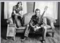
North Mississippi Allstars Oct 2