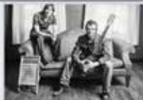
North Mississippi Allstars Oct 2