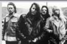
Drivin' N Cryin' Nov 19

Come enjoy nationally renowned musicians in an intimate setting at the historic Lyric Theatre in downtown Blacksburg! The Lyric Theatre has been providing quality arts & entertainment in the New River Valley for over 100 years!