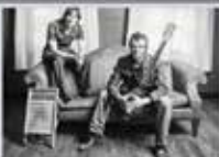
North Mississippi Allstars Oct 2