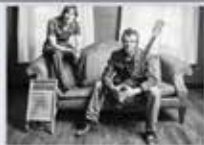
North Mississippi Allstars Oct 2