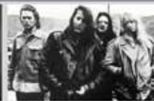
Drivin' N Cryin' Nov 19

Come enjoy nationally renowned musicians in an intimate setting at the historic Lyric Theatre in downtown Blacksburg! The Lyric Theatre has been providing quality arts & entertainment in the New River Valley for over 100 years!